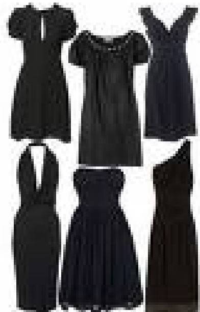
Little Black Dress