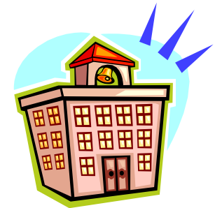
Indian Hill Elementary School

P ositive B ehavior I nterventions & S upports