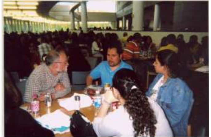
Teacher, Grainger employee and students discussing careers.