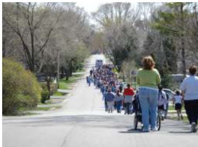
All School "Walk for Diabetes"

W.J. Murphy has been involved this year, once again, in a number of community and family involvement projects. Some of the events planned this year were the Annual Father/Daughter Dance, a Mother/Son Dance, two Family Movie Nights ( Over the Hedge and Happy Feet ), a Family Reading Night, a Cinco de Mayo celebration, a weeklong fundraiser for the American Diabetes Association capped off with a whole-school "Walk for Diabetes," and two Food Fundraisers for local food pantries. Here at W.J. Murphy, we believe that community plays a large role in the education of our children's lives. You are always welcome to come and celebrate with us!