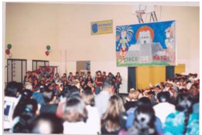
Murphy students leading a Cinco De Mayo celebration.